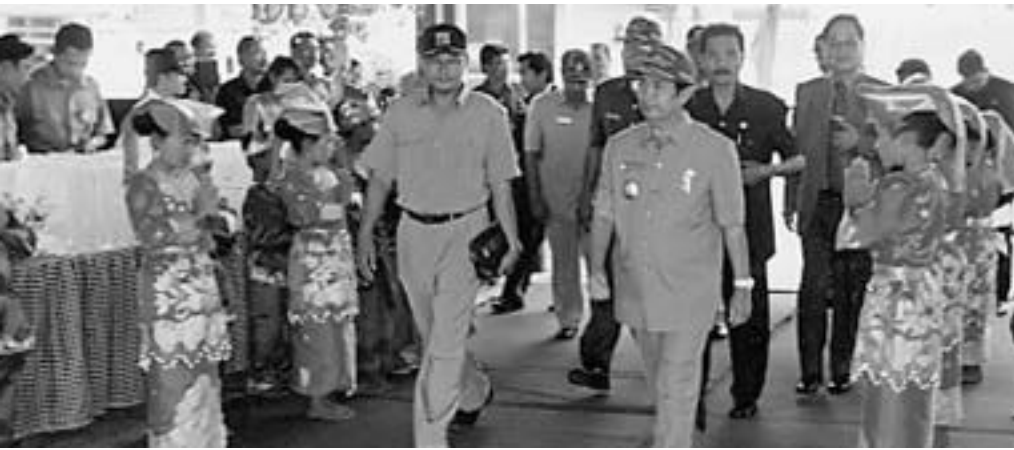
Arrival of the Deputy Governor of West Sumatra.