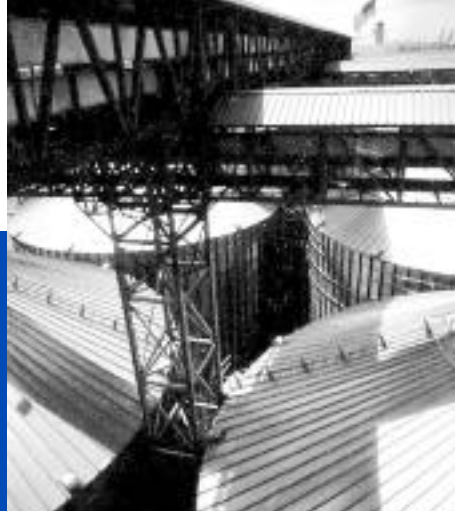
Grain storage bins