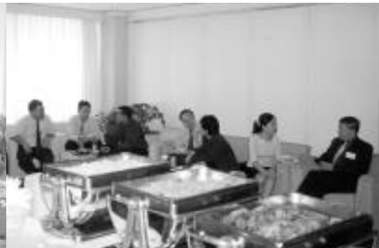
Analyst Briefing held on 21 August 2002