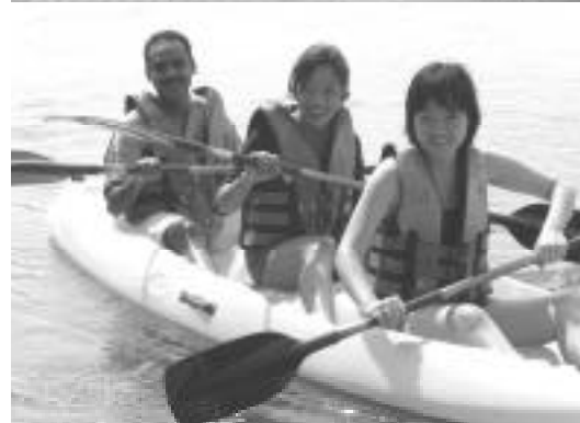
PPB staff having a great time at Club Med