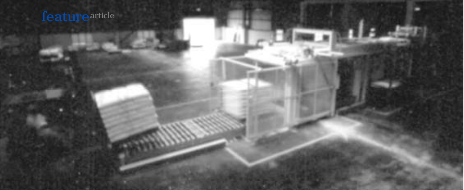
Bag flour palletising system