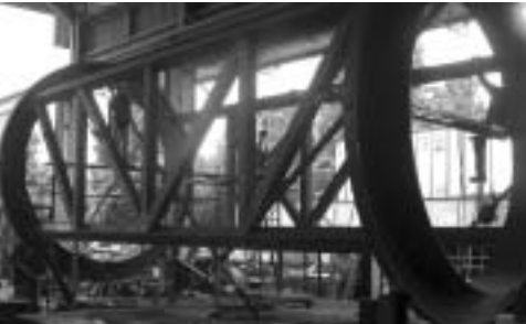
Workshop Fabrication of Equipment