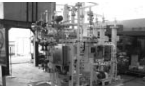
Booster Pump Skid for Petronas