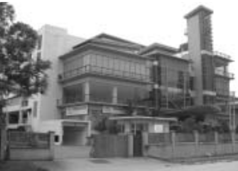
MES's office in Subang Jaya