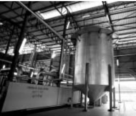
Continuous Sludge Tank in the Palm Oil Mill