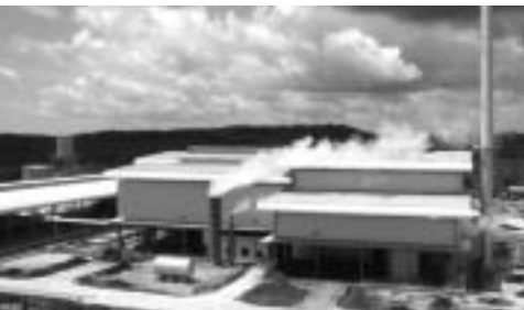
Suburmas Palm Oil Mill