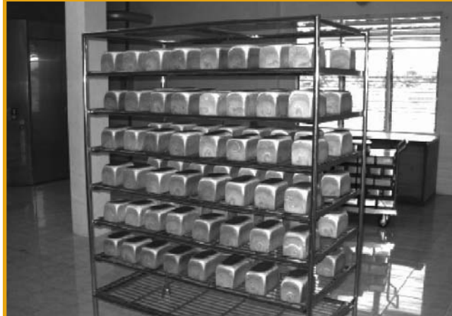
High protein bread ready for distribution