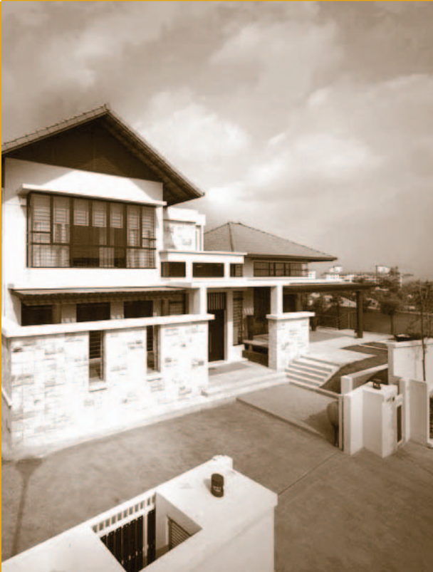
Type B Bungalow