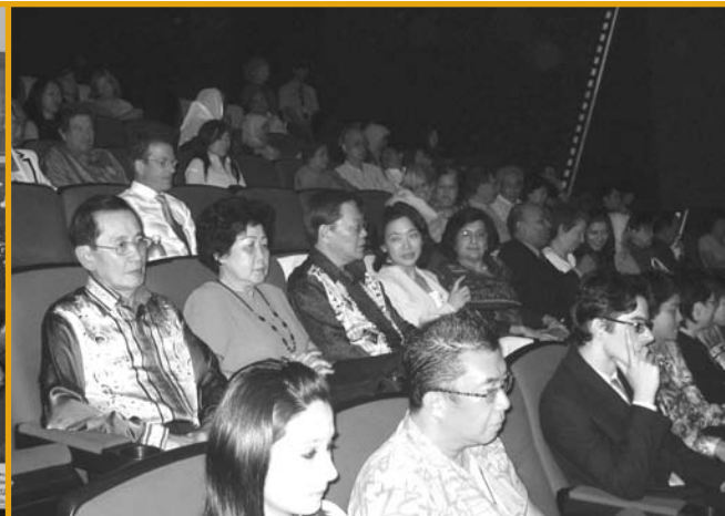
Guests at the special screening of "Merry Christmas" at Gurney Plaza, Penang.