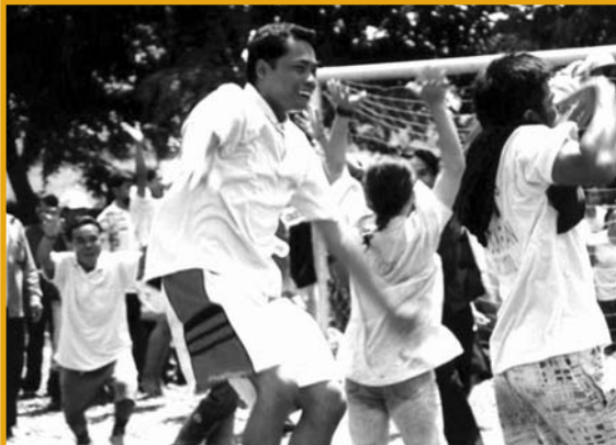
Workers enjoying a game of soccer