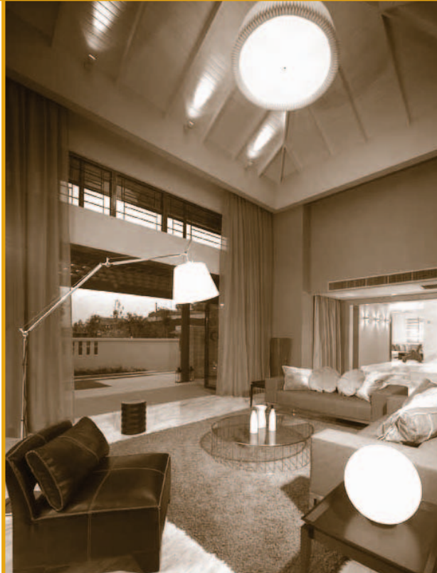
Contemporary concept showhouse

The Phase 1 bungalows will be launched on 12 September 2006 and are expected to be completed by December 2007. The estimated total sales value for Phase 1 is RM 102 million and RM 60 million for Phase 2.