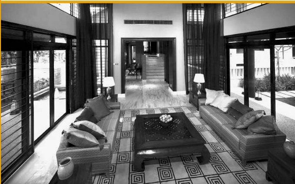
Rustic concept showhouse

PPB Hartabina Sdn Bhd (PPBH) is a wholly-owned subsidiary of PPB Group Bhd incorporated in August 1972. Its core operations are residential and commercial development; and property ownership and management.