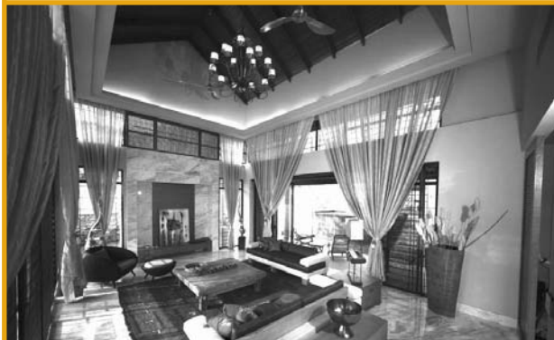
Oriental concept showhouse