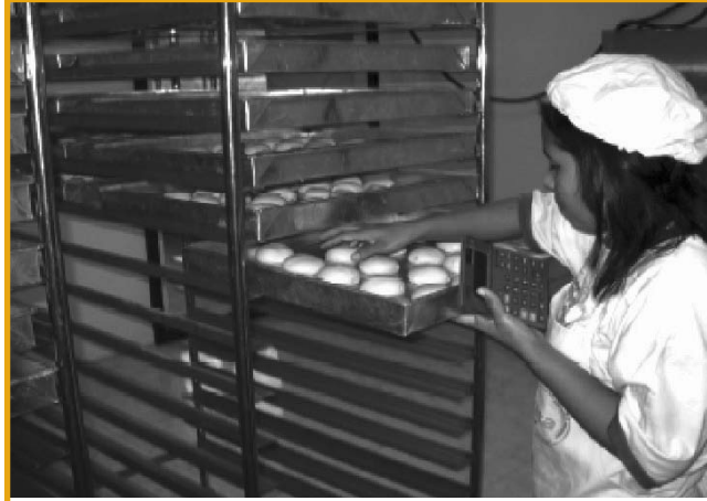
Mustika's bakery set up as a social project

A marketing and distribution network has been established within the Group's estates whereby orders from its own estates as well as from neighbouring estates are received.